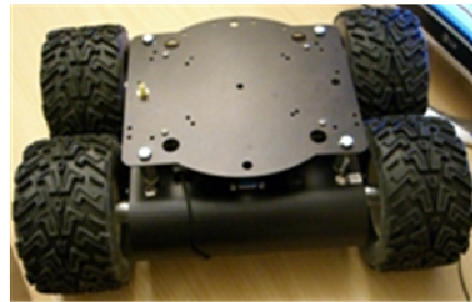
Wifibot Lab (RS232)