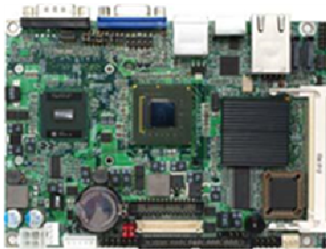
X86 CPU WinXPe or Linux